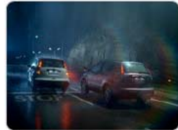
The young lady's car darts away in the pouring rain leaving the man's car behind