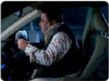
The man's car shuts down. He is seen trying to crank his car to start