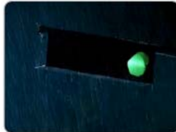
The signal light turns green