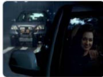
The young lady looks at the sad plight of the man from the rear view mirror, smiles and drives away