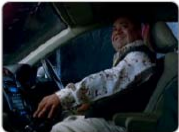
The man enjoying the competition is seen being over confident