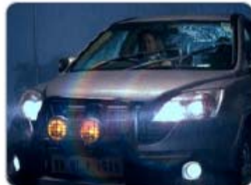
Man switches on his snazzy fog lamps and headlights to show his power