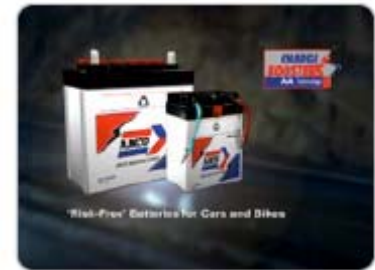
Product window with FVO: "AMCO Batteries for cars and bikes with unique charge boosters."