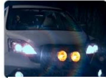
The lady does the same in reply