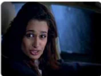
The confident young lady talks to the camera: "Do you drive risk free?"