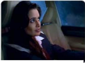
She is not amused