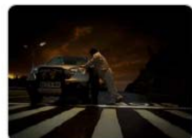
Dawn breaks to the roosters cry. The frustrated man is seen stranded at the same deserted traffic junction.